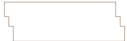
F: 3 step Z-profile